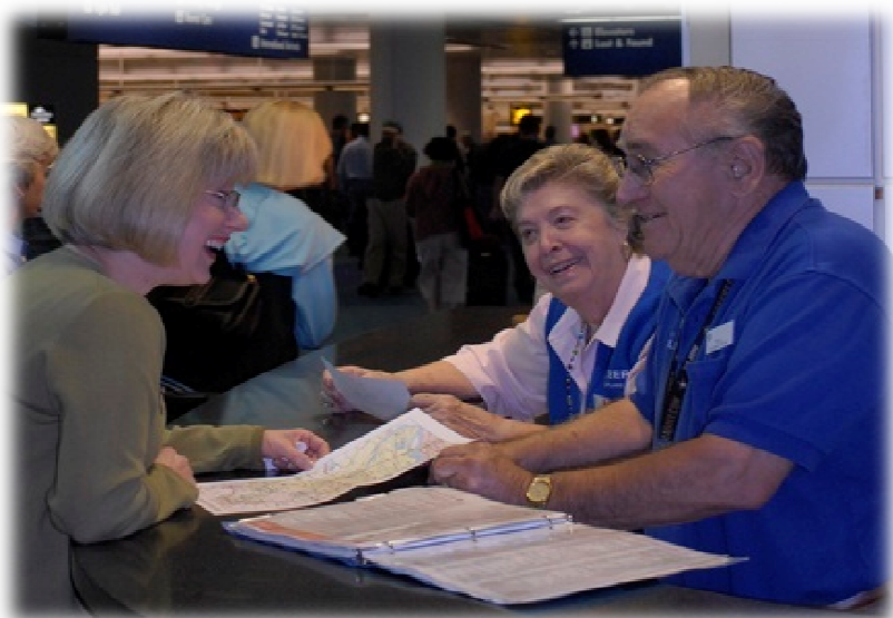
Airport volunteers can help answer your questions.

From roadway to runway volunteers in royal blue clothing can answer your questions from where to catch the light rail train to the latest flight information. They can provide you with directions to airline gates and ticket counters, as well as shops and restaurants. If available, they would be happy to take you to their break room for a complimentary cup of coffee!