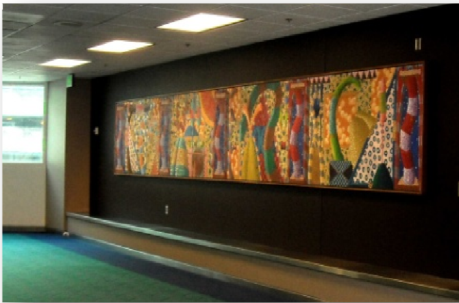
Jack Portland, "Provincial Narrative" Location: End of Concourse B, East Wall

Throughout the airport, and using a variety of mediums, artists tell stories of the social movements, industrial developments and artistic changes that have shaped the culture and people of the Northwest.