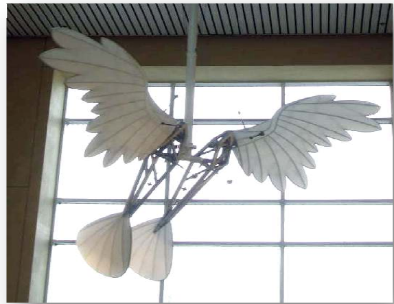
Miles Pepper, "Phenomena: Homage to Flight I" Location: Escalator to MAX Light Rail Train Platform